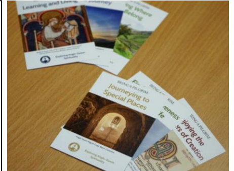
Being a Pilgrim prayer cards reflecting on the lives of Anglo-Saxon Saints