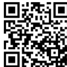
QR code for church website home page

During the coronavirus outbreak we started sending the pew sheet by email and phoning and posting information to those without Internet access. Both the pew sheet and Contact are also available to download from our website: " Contact " Magazine - St Mary's Burwell with St Etheldreda's Reach ( stmarysburwell.org.uk )