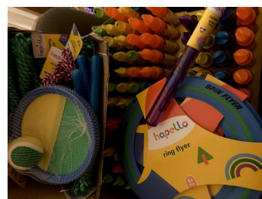
Lots of bubble wands!

community. Over the next few months, we'll be looking for opportunities to share the toys and games with local children and young people.